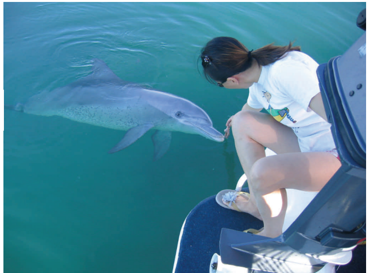
Making new friends in Monkey Mia