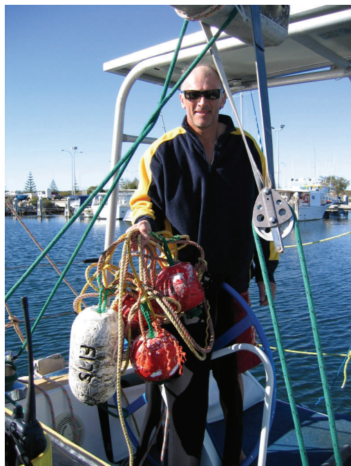
The catch from the Abrolhos trip 2008