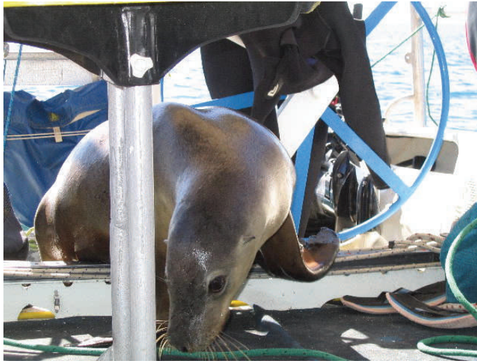
A slippery visitor in the Abrolhos Islands earlier this year.

What are your plans for the future with this boat? Maintenance, Maintenance and do some longer short handed races.